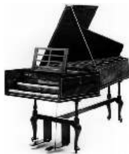
Double-manual harpsichord by Burkat Shudi (London, 1766) which formerly belonged to Rhodes and Thomas and is now in the Raymond Russell Collection.

However, then we decided to go a little further. It is becoming increasingly well known that 18th-century English pitch was about a half-semitone below modern pitch. As many harpsichords must be used with other instruments on occasion and brass and woodwind are relatively inflexible with altering their playing pitch, most of the instruments in the Russell Collection are commonly tuned to pitch levels which allow their use with other instruments, for example the common “Baroque pitch level” of A415 - an exact equal-tempered semitone below modern pitch.